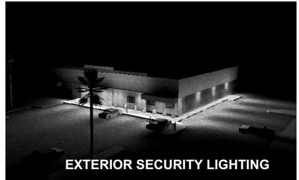
EXTERIOR SECURITY LIGHTING

All MOONLITE LED fixtures have a dual lighting function, for normal ambient lighting as well as emergency lighting. The night lighting option delivers big power savings, or can act as a low-energy booster for conventional ambient lighting fixtures.